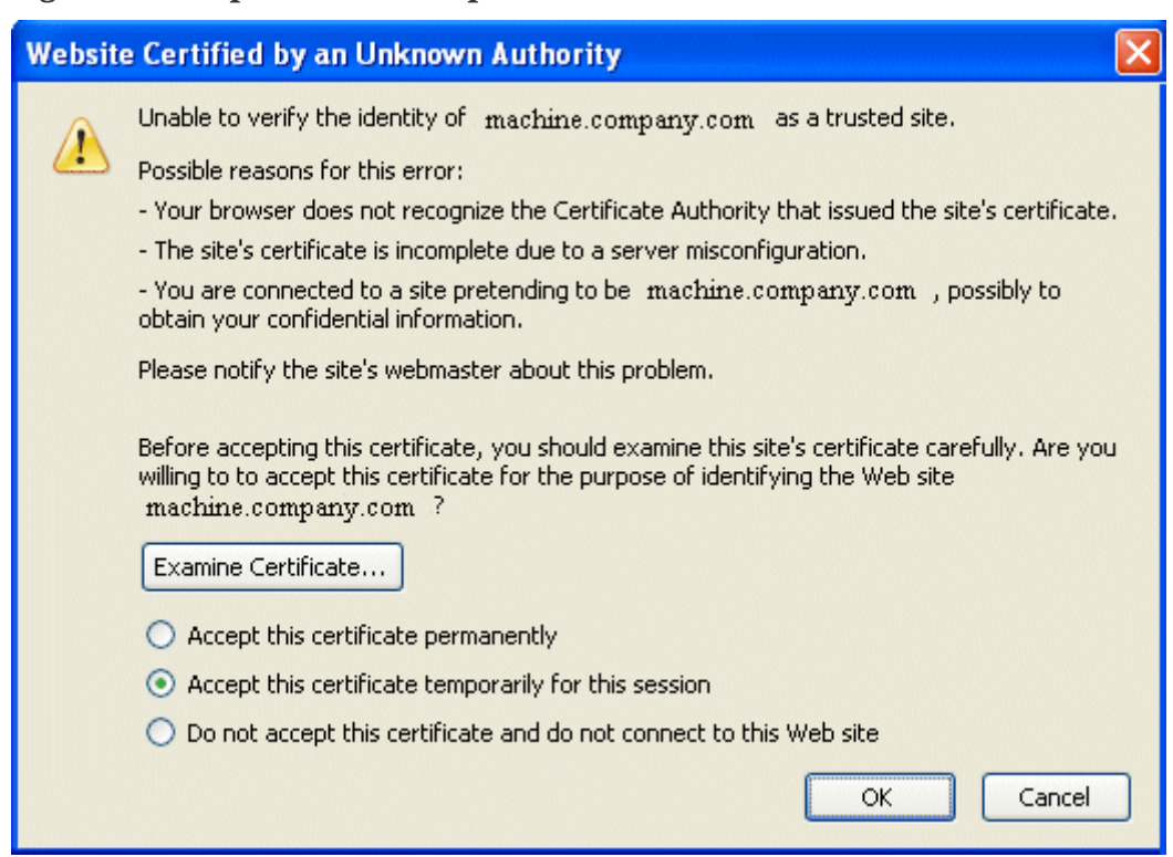
Figure 5-1 Sample Browser Response to Untrusted Certificate

Similarly, the first time asadmin receives an untrusted certificate, it displays the certificate and lets you accept it or reject it, as follows: (If you accept it, asadmin also accepts that certificate in the future.)